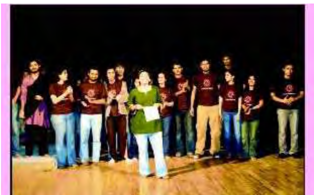
THE ONES WHO MADE IT HAPPEN!