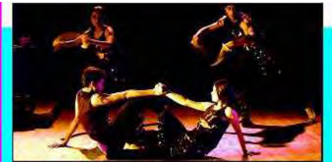
SAYING IT THROUGH DANCE