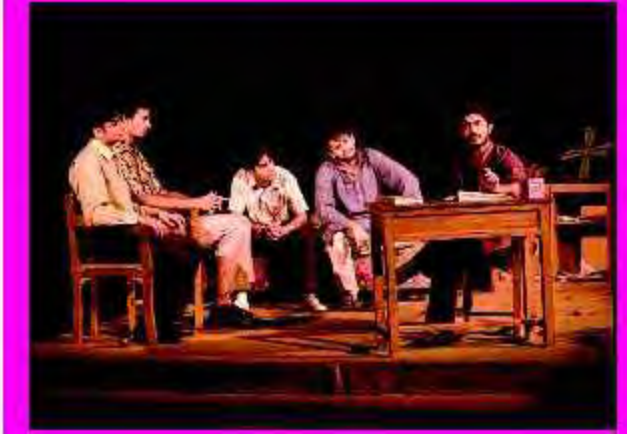
A scene from the play