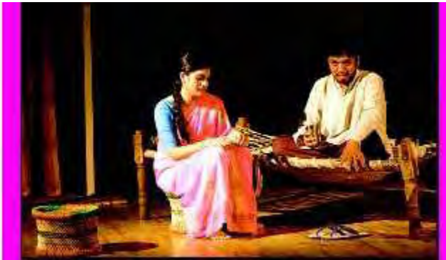
Sana Ally and Aditya Pawan playing Jamuna and Tanna, respectively